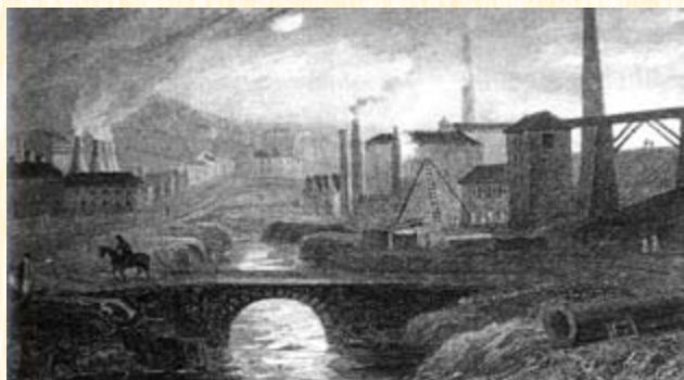
Nantyglo Works c1845

Please advertise the listed forthcoming Chartist Events: