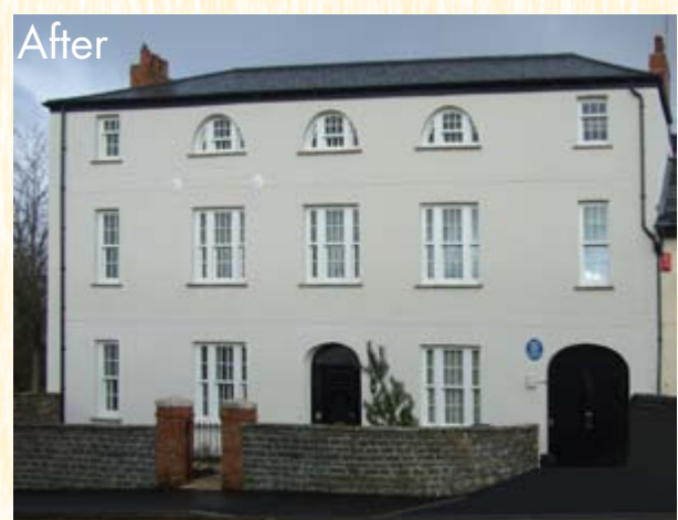
Vulcan House, Morganstown in Merthyr Tydfil, - Now