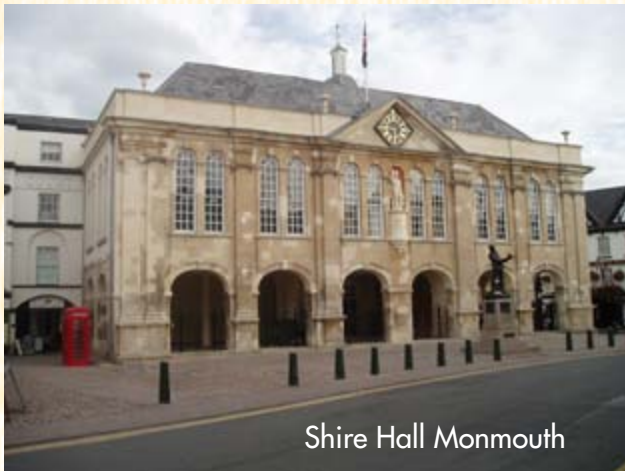
Shire Hall Monmouth